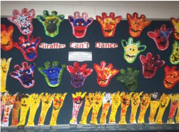
Some examples of student work made in Visual Arts class